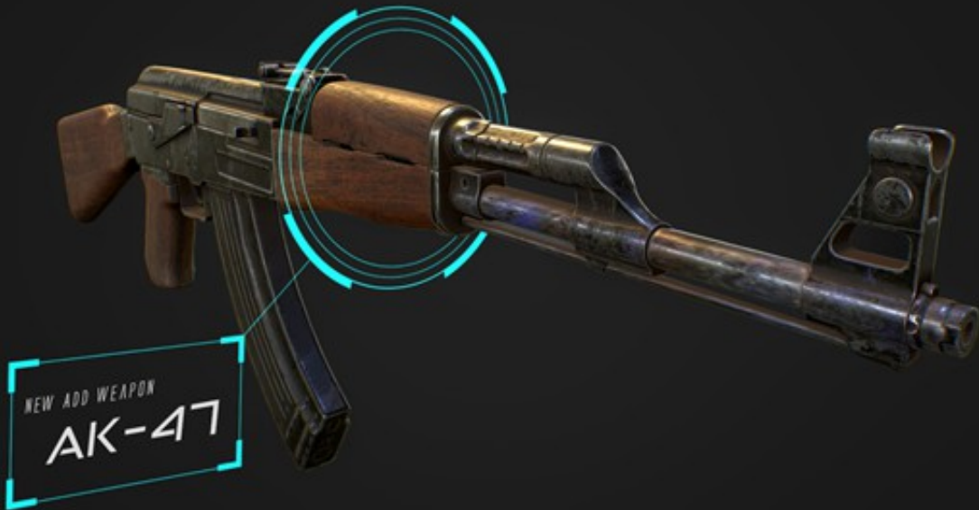
NEW ADD WEAPON AK-47